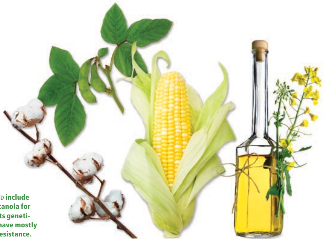
CROPS MOST COMMONLY MODIFIED include cotton, soybeans, corn and canola for its oil (left to right). The traits genetically engineered into them have mostly involved greater pesticide resistance.