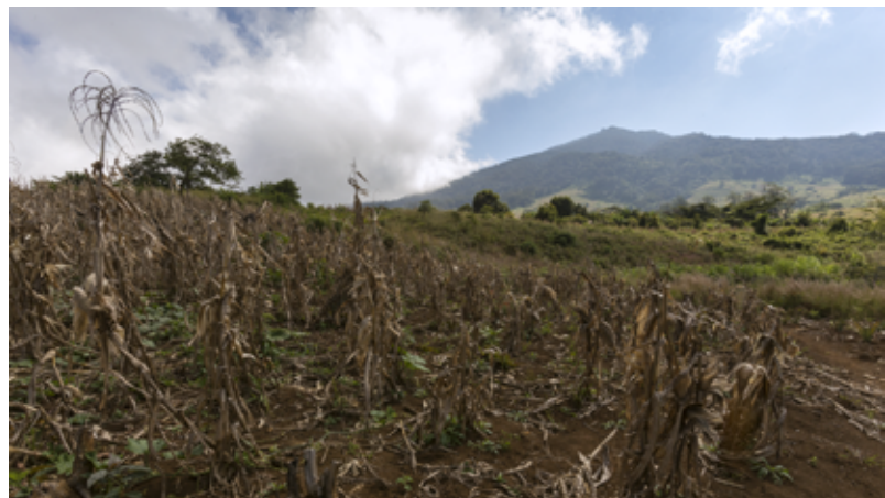
Agriculture and Deforestation