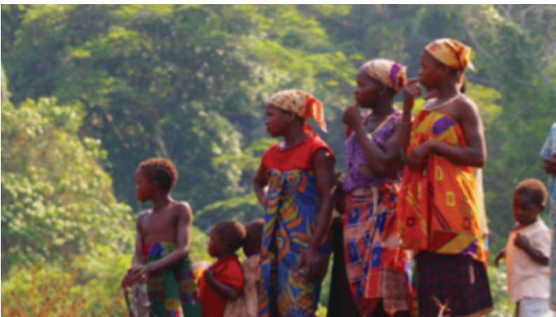
Increasing Human Population