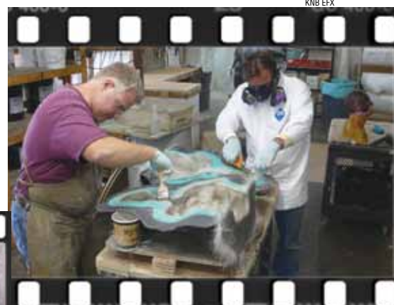
Two mold makers from KNB EFX fill a silicone mold with fiberglass to make a life cast for an actor. Wrinkled skin or bite marks will be sculpted on this cast later.

High-quality skins and prosthetics—which can be anything from fake jowls to pointy ears—are custom-fitted to the actor who will wear them. The first step is to make an exact copy of the actor's face or body part,