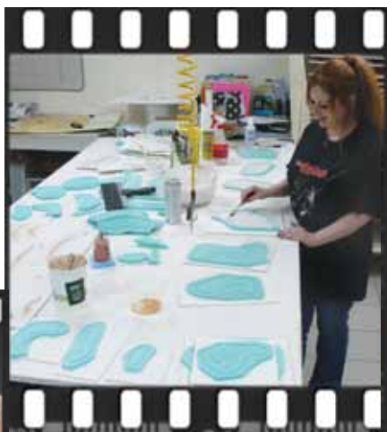
An employee of KNB EFX prepares molds that will be filled with silicone. Once the silicone sets, it is peeled from the molds and glued to an actor's face.

Latex is an ideal material for artificial skin because it has a fine enough structure to reproduce frown lines and wrinkles, and is pliable enough to pick up movements of the facial muscles. But its color on film depends upon the lighting conditions on set, a complication that led Berger and his team to switch to silicone for the upcoming movie, The Voyage of the Dawn Treader .