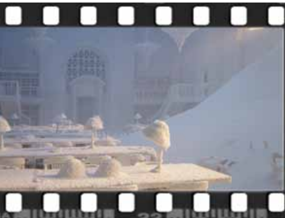
From the film The Day After Tomorrow (2004), this image shows frozen arctic effects.

Crownshaw's signature product is paper snow. But there is more to it than you might think. If you try to make snow by cutting up paper, you get confetti. Because the paper “flakes” have straight edges, they don't fall right and, once on the ground, blow about like dry leaves. Snow Business's paper snow is torn rather than cut, so the edges are ragged. The torn edges make the snow flakes tumble as they fall, and, once on the ground, clump and drift like real snow.